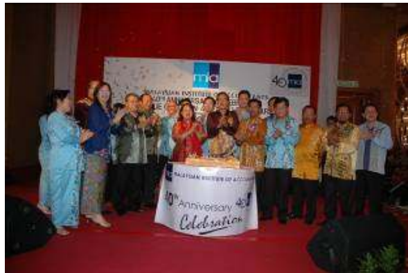
Celebrating 40 years of MIA in Negeri di Bawah Bayu