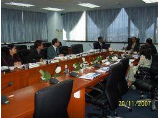
The meeting in progress