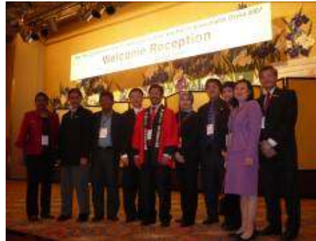
The MIA delegation comprised of MIA Council members and management