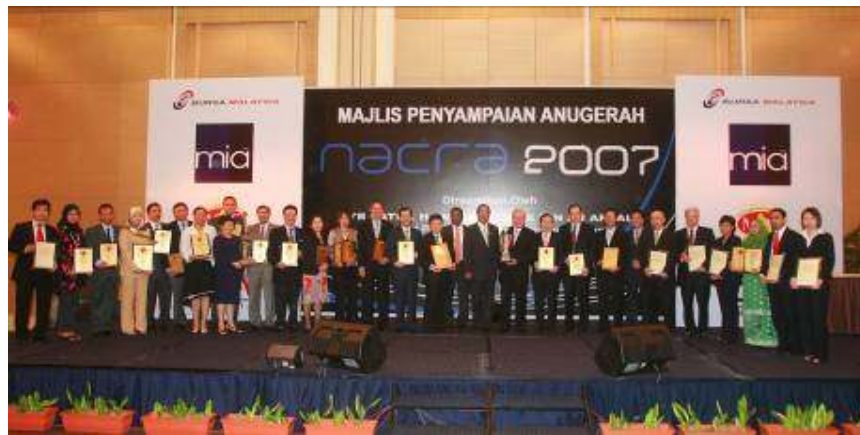
All the winners of the NACRA 2007 awards