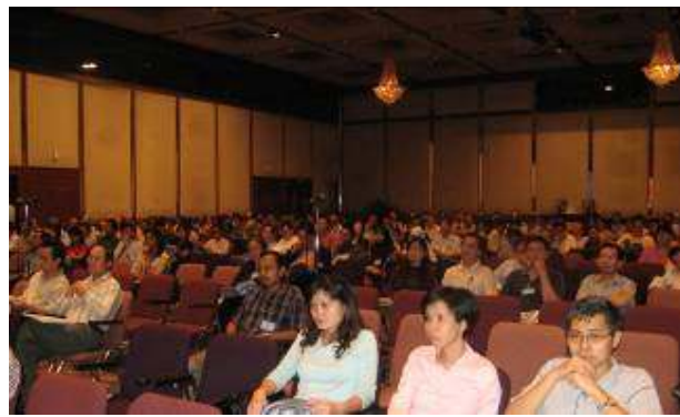
Members at the AGM