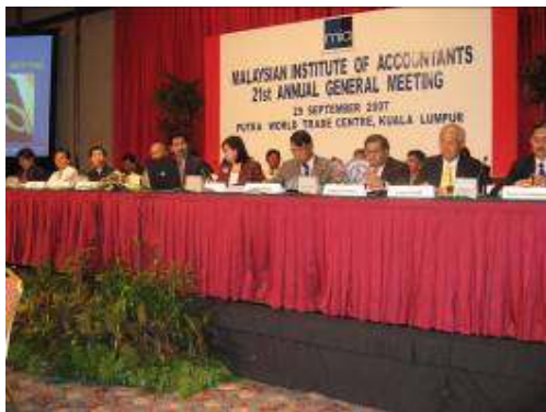
Council members at the AGM