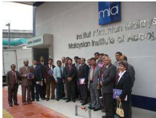
The delegation from ICWAI with MIA representatives