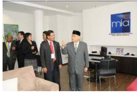
A tour of the MIA office in Penang