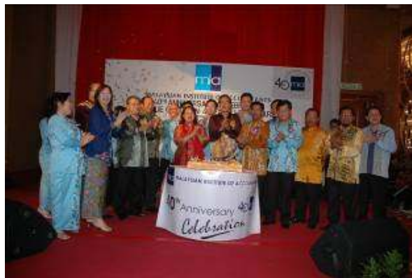
Celebrating 40 years of MIA in Negeri di Bawah Bayu